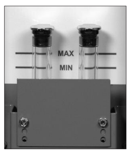
Oil fill level site glass.