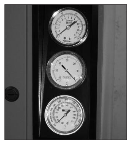
Discharge pressure, filter restriction, and temperature gauges are standard.